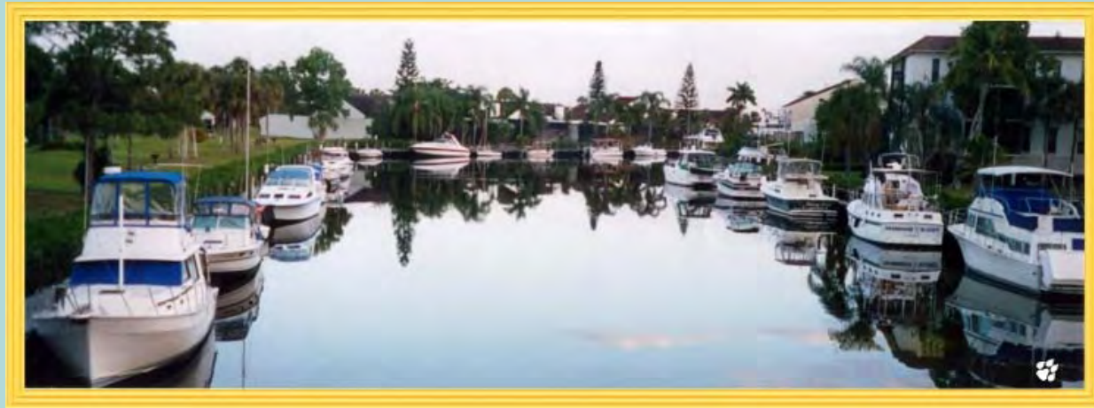
A Condo view of one of the waterways at Emerald Point. Charlotte Harbor and the Gulf waters are a short distance from your back door. Power or sailboat, the choice is yours and there is nearly a mile of docks here for your needs.

The largest of three pools here at Emerald Point. This one has a Jacuzzi and is heated for your swimming pleasure when the air is cooler. There is shuffle board and Clubhouse adjacent to the pool.